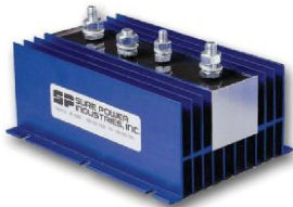
Stock No. 80069