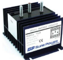
Stock No. 80089