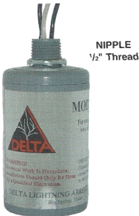
Weatherproof Enclosure N-4 CASE DIMENSIONS: 4 1/2" High 2 1/4" Diameter

LA602DC for 0 to 1100 Volts, dc LA302DC for 0 to 500 Volts, dc LA302R for 0 to 300 Volts, ac