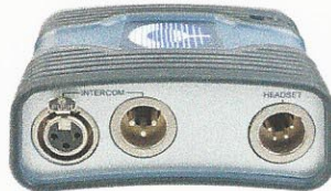
RS-701 Bottom View