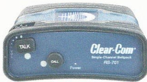
RS-701 Top View